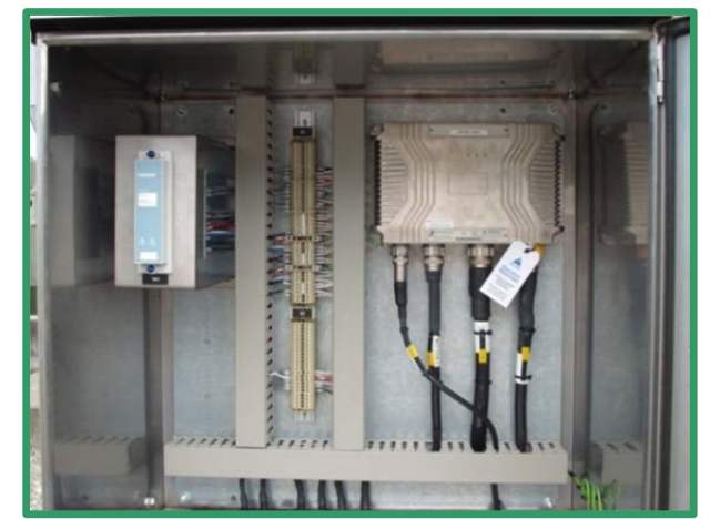
Figure 3: PIU mounted in 11 kV switchgear