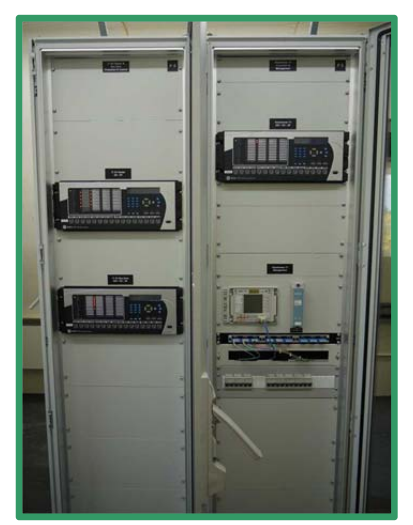
Figure 5: Front view of relay panels

estimates of the cost comparison with a traditional installation in a small substation such as this (one relay per feeder, hard wired) are that the costs are very similar. The IEC 61850 Process Interface Units installation may be slightly more expensive; however the added benefits in flexibility may frequently outweigh the initial slightly higher costs. For the illustrated substation, after the design was finalized and under construction, a large dairy factory was built in the area, requiring extensive upgrading of the sub-transmission network to meet reliability and quality of supply requirements. Orion needed to retrofit three ended line differential protection to the incoming 33 kV line and later upgrade the line to 66 kV. All that was required in terms of installation was to mount a relay in one of the existing panels, connect power and plug in a couple of optical fiber jumpers and it will be operational - a couple of hours installation work followed by commissioning tests. (You do of course have to also configure the IED/relay).