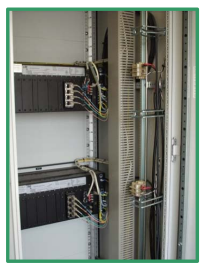
Figure 6: Rear view of relay panels